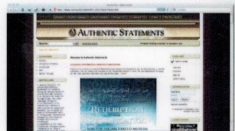
Visit us Online

5000 Locust St. (Side Entrance) Philadelphia, PA. 19139