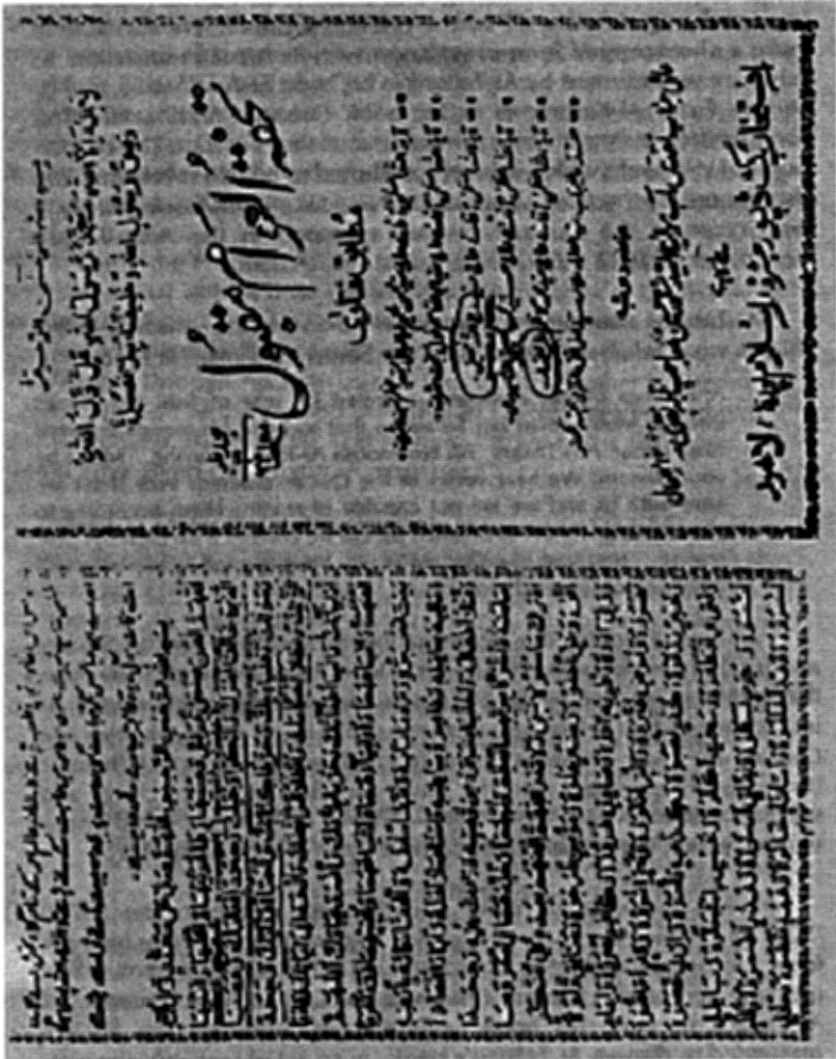
Photocopy of the original fatwa (religious verdict) encouraging the Shi'ite masses to curse the two Caliphs Abu Bakr and 'Umar. Signed by six of the contemporary Shi'ite scholars and clergy among them Khomeini and Shariat Madari